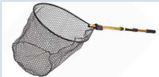
Frabill Nets photo

If a net is needed to land or control the fish, always use a knotless, rubber-coated net.