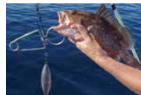
Weighted spring release tool