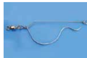
S-shaped wire hook clip