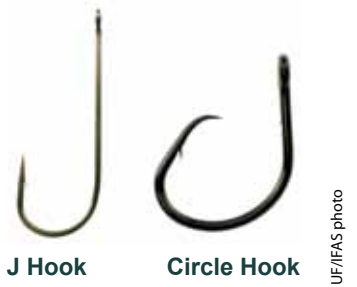
J Hook Circle Hook