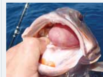
Everted, or protruding stomach

If you see any or all of these signs, the fish will probably need help descending, but sometimes the signs are not readily apparent. Only fish that are unable to swim back down should be subjected to additional handling. If the fish is actively fighting and attempting to swim down when it is brought to the surface it may not need help to be descended. Practice and experience will help you make the best decision.