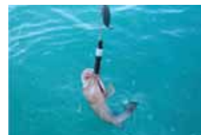
Pressurized release tool

In recent years a number of descending devices have been developed – some home-made, some manufactured – to descend deep-water fish without having to puncture the body cavity. Although more research is needed, there are indications that descending tools and techniques may greatly increase survival of released fish. A few are shown. This does not imply endorsement of a particular product. The type of device to use is often based on individual angler preference and local fishing conditions.