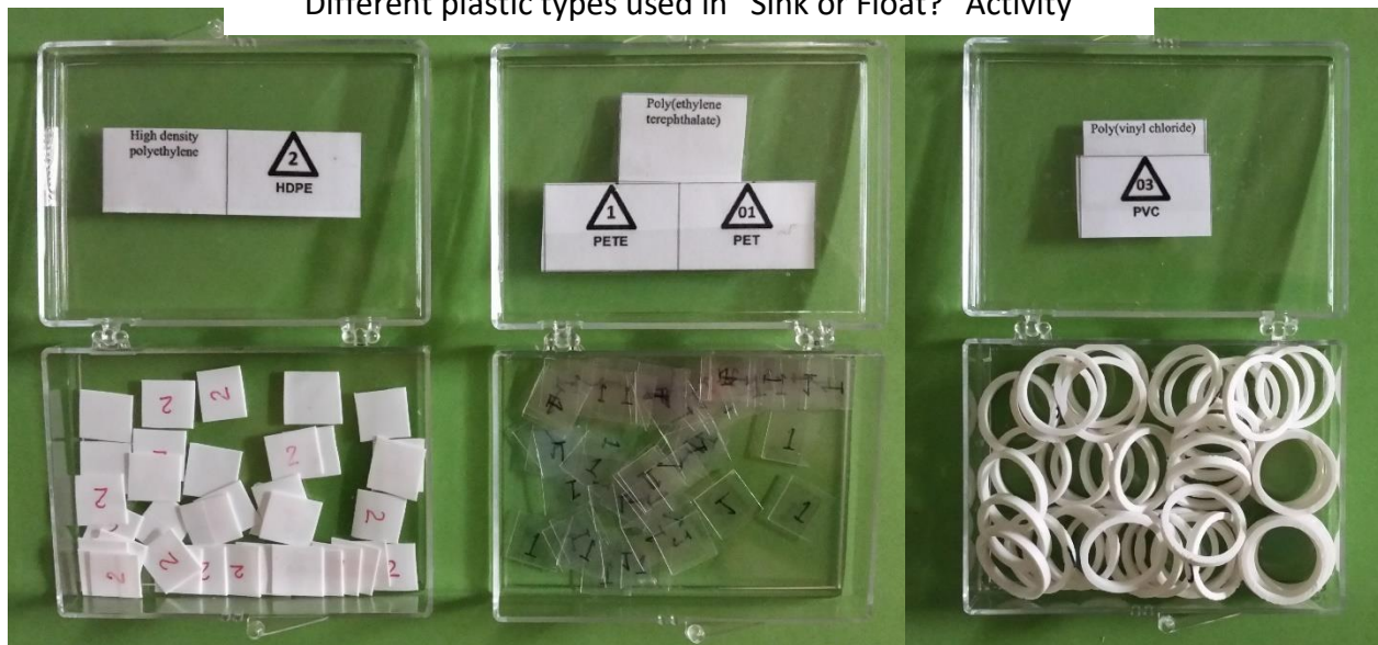
Different plastic types used in "Sink or Float?" Activity