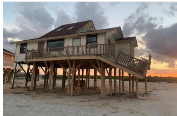
Figure 6 Damaged house at Summer Haven, where Old Highway A1A has been subjected to erosion impacts since the 1960s, costing taxpayers millions of dollars to try to protect and replace the road for a handful of homes, most of which were built along the road after decades of erosion impacts to the road. Photo: Thomas Ruppert, Florida Sea Grant, Sept. 2022.

As roads continue to suffer from increased erosion and flooding due to higher seas, the costs of maintenance and rebuilding impose a heavy toll on local governments responsible