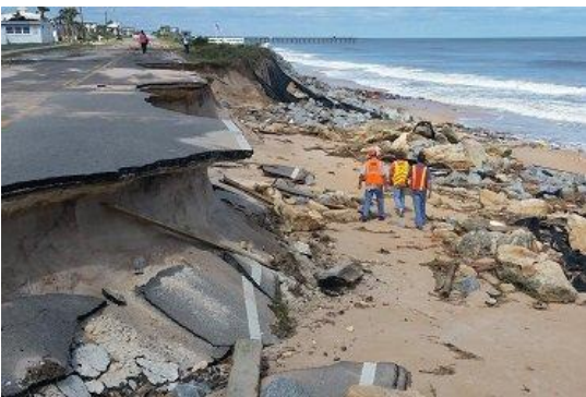
Figure 5 Highway A1A in Flagler Beach after Hurricane Matthew