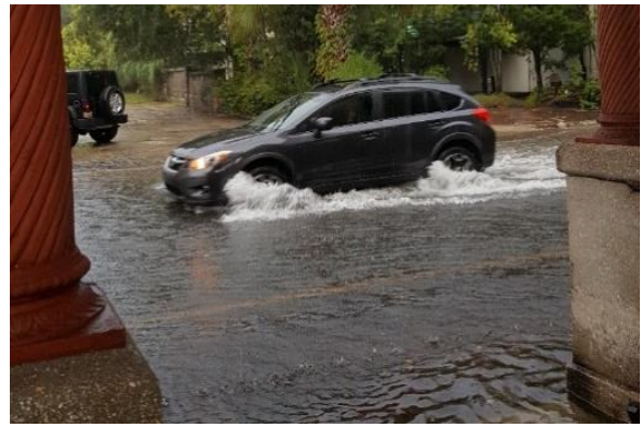
Figure 2 King Street, St. Augustine, Florida during high tide flooding