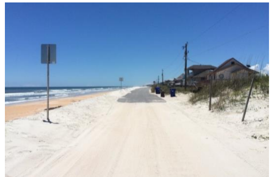
Figure 4 End of pavement at Old A1A, St. Johns County, Florida, 2016.