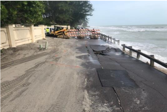
Figure 3 Casey Key 2020