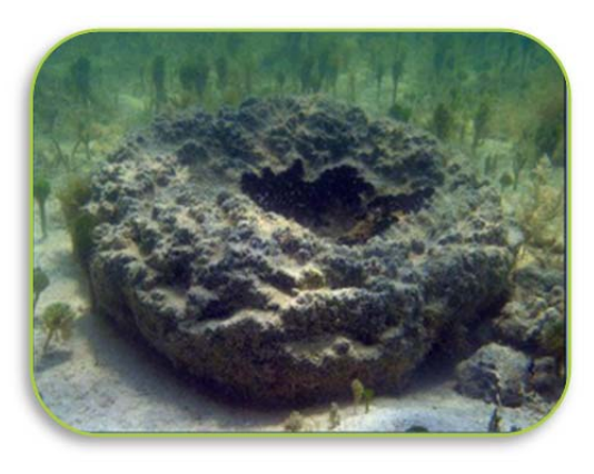
A healthy loggerhead sponge.

Because of their abundance and size, sponges play an important part in naturally functioning ecosystems. As the dominant filter feeding organism in these habitats, they play a critical role in cycling food resources. They also alter water chemistry by cycling nutrients, and provide essential nursery habitat for important commercial fishery species like spiny lobsters and stone crabs.