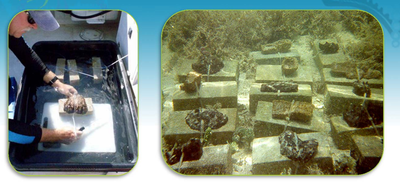
At left, preparing sponge transplants. At right, sponge cuttings healing before transplantation. Below, a healthy vase sponge.

Sponges are animals that are among the most visible residents of the hard-bottom habitats typical of the Florida Keys and Florida Bay. Some sponge species, like the vase and loggerhead, can grow to over 1 meter in diameter and live for decades if not longer.