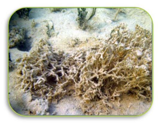
A loggerhead sponge after a die-off.