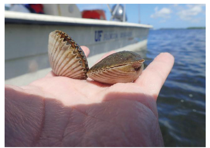
Figure 1. Freshly harvested scallops can be a great addition to a summertime meal.

season dates, which can be found on the Florida Fish and Wildlife Conservation Commission (FWC) website: http:// myfwc.com/fishing/saltwater/recreational/bay-scallops/.