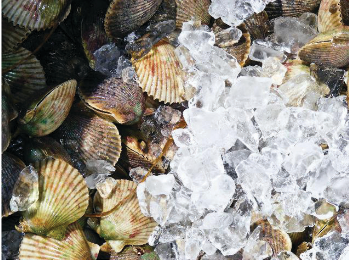
Figure 4. Once scallops are collected, be sure to place them on ice.