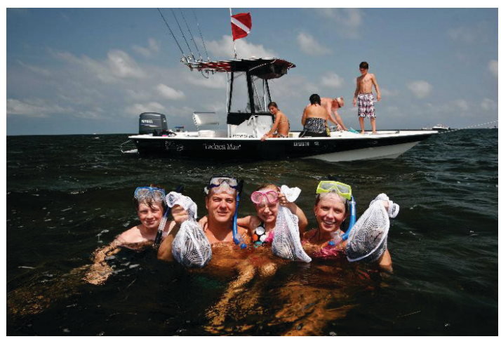
Figure 2. When searching for scallops, try not to venture too far from the boat.

tethered to a diver or a snorkeler, the divers-down flag must be at least 12 inches by 12 inches.