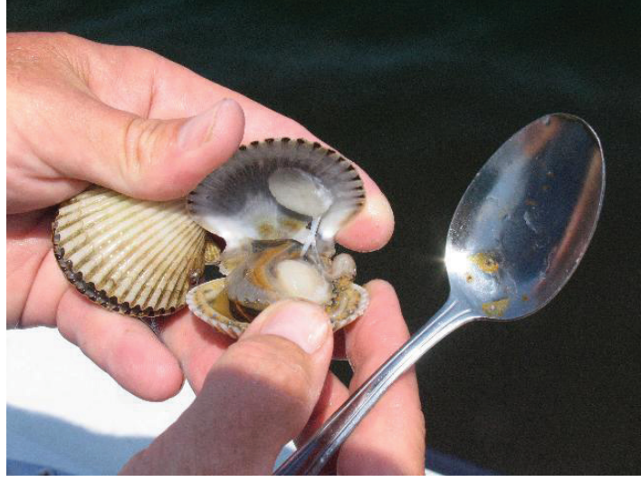
Figure 5. A spoon or butter knife can be used to clean scallops.