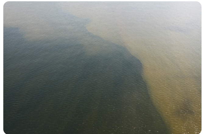
Image: K. brevis bloom

Karenia brevis blooms follow a sequence of developmental stages that define a bloom. Blooms mostly occur in the fall although there is interannual variability. During initiation, K. brevis cells come from offshore and are transported shoreward. During the maintenance stage, cells are dispersed alongshore expanding their geographic range. Termination is defined by a population decreasing to background levels or advected out of the area. The exact mechanisms underlying each bloom stage and the transition from one stage to the next is still largely unknown, although progress has been made.