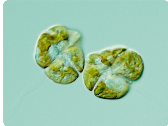
Image: Karenia brevis (light micrograph)