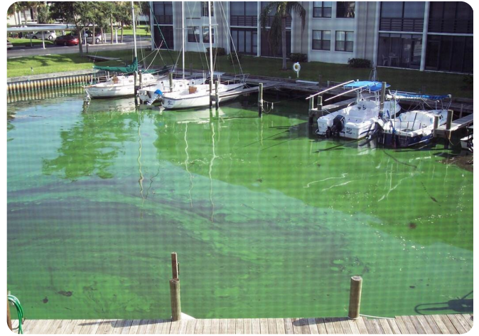
Image: Microcystis bloom in the St. Lucie Estuary, 2004

At any given time, there are a variety of phytoplankton, including bloom-forming species, in the water column. The triggers that allow one species to be selected and form a bloom over another species are complex, including nutrients,