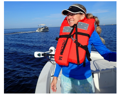
For-hire guides operating in federal waters have additional requirements.