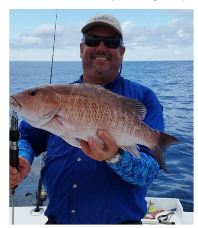
For-hire requirements differ when targeting inshore versus reef species.

*New reporting requirements for federal permit holders scheduled for 2020.