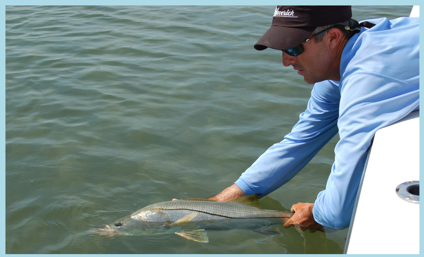
Managing a successful guide business requires much more than catching fish.

Florida fishing guides represent an important sector of the fishing industry by providing access to the marine environment and inshore, offshore and migratory fisheries. The process of running a fishing guide business is complex, with a variety of requirements. This document is designed to assist guides by providing a quick checklist of basic requirements needed to operate as a for-hire guide in the state of Florida and adjacent federal waters. Every fishing guide business is unique so not all regulations will apply equally. As guides navigate this checklist, they should consider a variety of factors, including the type of charter they run, the vessel they operate, where they operate, and what species they target in order to determine if a requirement applies to their situation.