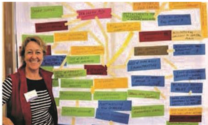
Figure 2. Influence diagram created during a climate roundtable in Southeast Queensland, Australia (Ross et al. 2012)