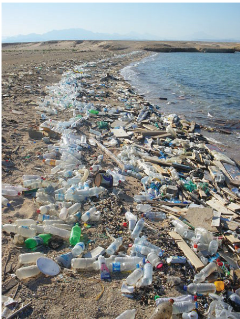
Figure 4. Garbage, mostly plastic bottles, accumulated on a beach. Tides can wash these items back into the ocean, where they can harm corals and other marine life. Participating in a beach cleanup can reduce this risk while making local beaches more beautiful.

Finally, help keep garbage on shorelines (Figure 4) out of the ocean by participating in a local beach, river, or roadside cleanup. Helping with the plastic problem can also be as simple as bringing a spare bag along to collect litter on your next walk! Contact your local UF/IFAS Extension office for more information and to find local cleanup events in your area.