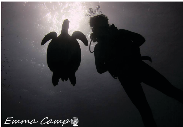
Figure 8. A diver observes a sea turtle in its natural habitat. Dive responsibly by maintaining neutral buoyancy and clasping your hands to avoid touching the reef.

If you're diving in a warm climate, consider ditching the gloves! Gloves have been shown to make divers more likely to grab the reef underwater (Camp and Fraser 2012). If you must use gloves, keep your arms crossed during your dive—you'll improve your buoyancy skills and be less tempted to touch (Figure 8).