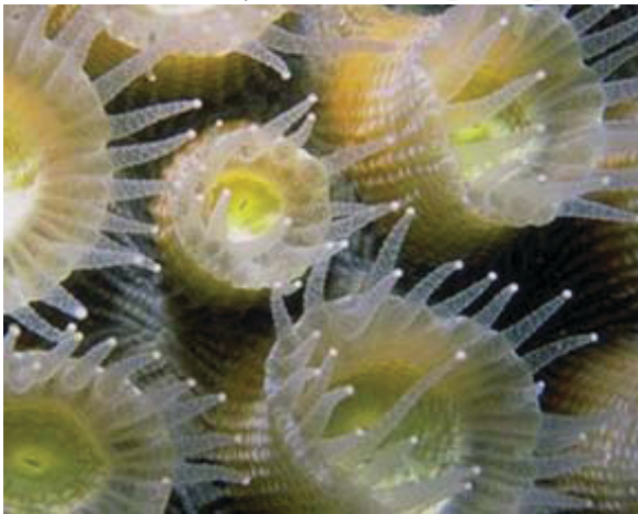
Figure 1. A close-up photo of a coral colony, showing several individual coral animals. Jellyfish-like tentacles extend from each animal's body.

Coral reefs are one of the most diverse ecosystems on the planet. Corals are small animals related to jellyfish (Figure 1). Large groups of these animals live together and form huge interconnected colonies (Figure 2). Many corals have a special relationship with a type of single-celled algae. The algae live inside the coral's body and produce most of their host's food through photosynthesis. Coral reefs are often found in shallow, tropical seas where these algae have enough sunlight to make food. The algae also give the coral its color—a healthy coral is typically yellow to brown (Figures 1 and 2). Using energy from the algae, some corals form reefs by building an external skeleton from a mineral called calcium carbonate. These reefs are an essential habitat for a wide variety of animal and plant species.