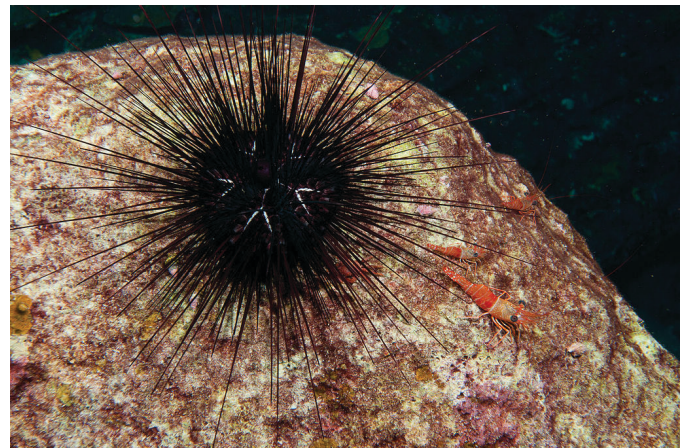
Figure 7. A long-spined sea urchin. These animals are algae grazers on Caribbean reefs and should be left alone to do their important work.

Reefs overgrown with seaweed are bad for corals, fish, and divers. Although the harvest of parrotfish is not prohibited in Florida, crossing them off your personal list of fished species is a decision the coral reefs will thank you for! In Florida and the Caribbean, the long-spined sea urchin (Figure 7) was another important grazer of algae on coral reefs. Their numbers declined dramatically following a disease outbreak in the 1980s. Scientists believe this was a major factor in the decline in coral reef health across Florida and the Caribbean. Although they are no longer abundant, some divers and snorkelers still consider the long-spined sea urchin a nuisance because of its sharp spines. If you spot these important critters while diving or snorkeling, please do not disturb them.