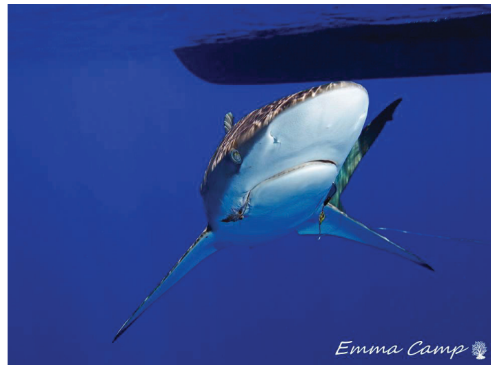
Figure 5. A silky shark off the coast of Florida with a hook caught in its mouth. Sharks are top predators that help keep ocean ecosystems healthy.