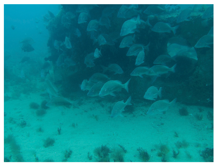
Figure 2. An example of an artificial reef with some smaller reef fish near it.

sensitive natural habitats. In other cases, artificial reefs can serve to protect coastlines and beaches by buffering wave action and reducing storm damage (Harris 2009). In Florida, some reefs are deployed specifically to help protect coral and natural hard bottom habitat, especially in popular recreational diving areas.