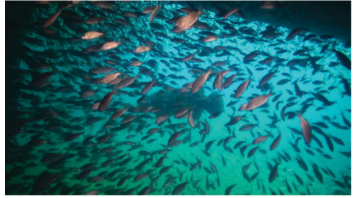
Figure 3. Increasing fish populations are often the ultimate goal when artificial reefs are deployed.

by many fish (Wall and Stallings 2018). Some fish species are even known to "recruit" to artificial reefs and use them as nursery habitat. At the same time, other studies show artificial reefs clearly attract larger fishes (e.g., jacks, tuna, sharks; Simon et al. 2011). Regardless of how many fish are "attracted" versus "produced," artificial reefs are likely to affect fish vital rates, which are factors that affect population numbers, such as growth, reproduction, and survival. More on how artificial reefs impact fish and these vital rates can be found in part two of this artificial reef series.