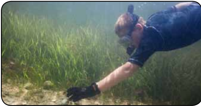
Snorkeling over shallow seagrass is the most common method of harvesting bay scallops.

effective way to reach hundreds of potential scallopers. Before the season began this year, we gave three live webinars (two mid-day and one evening) focused on harvest regulations, boating safety, safe seafood handling practices, scalloping techniques, scalloping locations, species biology and the state's scallop population monitoring program.