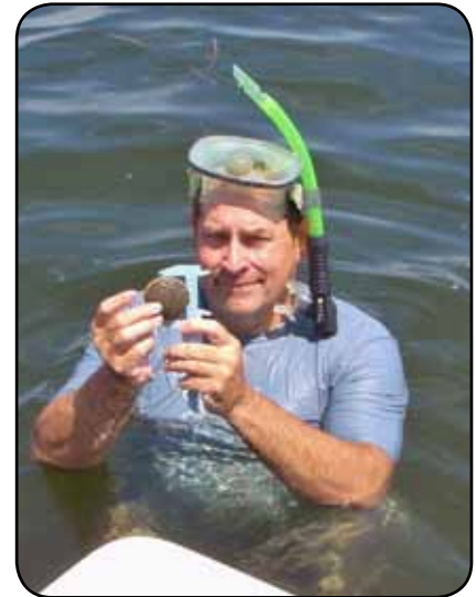
A volunteer measures a scallop in Pine Island Sound.

The results this year were mixed. Pine Island Sound volunteers counted 1,026 scallops, up from 335 last year. Lemon Bay and Gasparilla Sound counts, however, were down this year. Volunteers there found 24 scallops compared to 163 in 2010, although that may be due in part to difficult weather conditions. Sarasota Bay and Tampa Bay scallop searches found 10 and 5 bay scallops each. These results demonstrate the importance of conducting research, education, restoration and monitoring of bay scallop populations in southwest Florida using a uniform and coordinated approach across the entire southwest Florida region.