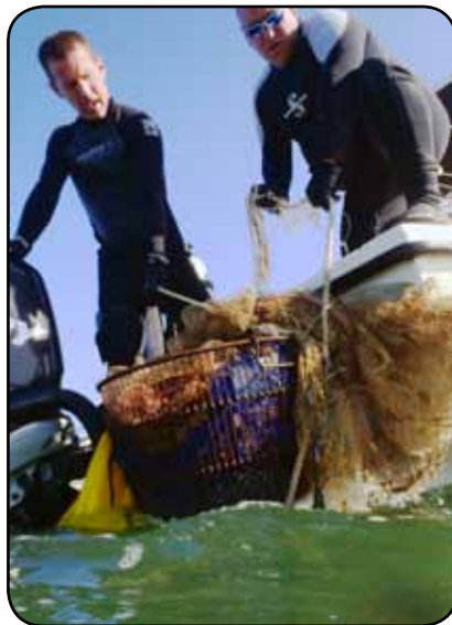
The Collier County Sheriff's marine unit members remove debris from the reef.

The Santa Lucia is a 47-foot Cuban turtle boat topped with large concrete pilings that create extensive relief and structure for fish. It sits in approximately 30 feet of water and is only 2 miles from shore. It is a popular stopping spot for fishermen to cast net bait before heading offshore, and is also heavily fished.