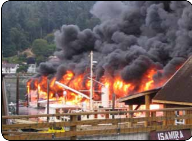
An example of what a marina fire in Steinhatchee could look like.