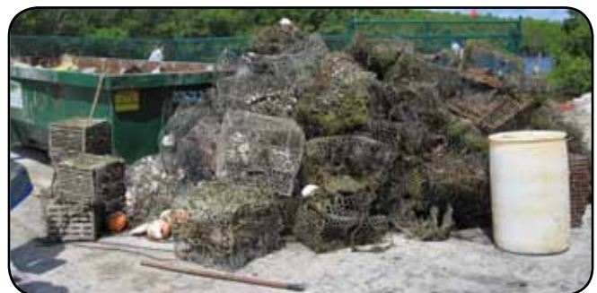
Three tons of debris were removed from Biscayne Bay and converted into clean energy during 2011 volunteer clean-up events.

Miami-Dade Sea Grant and NOAA Fisheries are partnering to implement a marine debris removal program in Miami-Dade County. This program, funded by the Fishing for Energy Program and NOAA, will use NOAA Fisheries Reef Visual Census data to create a long-term database for marine debris assessment, monitoring and removal along the Florida Keys reef tract. Using this database, sensitive and impacted areas along the Florida Keys reef tract will be identified and gear recovery efforts will target high density areas and/or high priority coral reef habitats. This project will also provide commercial fishermen with a means of disposing old gear and debris free of charge, helping to reduce costs for fishermen while protecting the sensitive habitats that are so important to their livelihoods. By partnering with the Fishing for Energy program, all collected debris materials will be recycled and processed into clean, renewable energy instead of sent to a landfill.