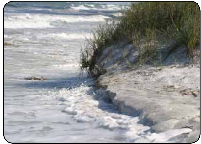
King Tide Project photo of tide at Fort De Soto Park, North Beach.

Once you hit "submit," this will produce a monthly map where you can quickly scan the numbers to see the highest high tide for the month. For example, if you do this for Old Port Tampa, FL you will see that the highest tide for the year was predicted to be Oct. 1, near 4 to 5 a.m.