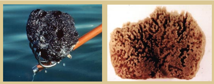
During a messy curing process, the tough outer black skin covering the living sheepswool sponge (left) is removed, as is the debris remaining in the sponge's canals. Market price is determined in part by how well the sponges have been cleaned.