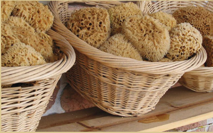
public domain photo