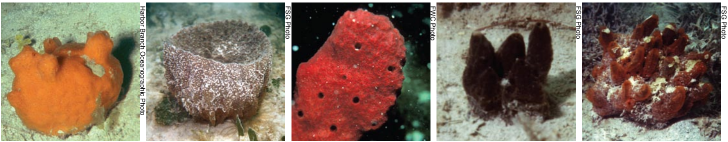
Marine sponges come in varying shapes and sizes — more than 9,000 species have been described worldwide. Gulf and Caribbean species include, from left, Forcepia , vase, finger, brown tube, and fire sponges.

Based on the industry’s embrace of the cutting practice and Sea Grant recommendations, the Florida Fish and Wildlife Conservation Commission (FWC) passed a measure that now requires sponge divers to harvest sponges by cutting. This insures that the sponge can grow back, and produce another harvestable sponge.