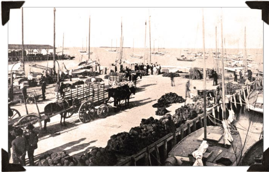
The worldwide demand for Florida sponges in the 19th century spawned a thriving fishery in the Florida Keys. Above, sponges are auctioned from the wharf at Key West.