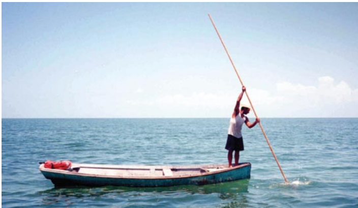
In the Keys, where diving for sponges is prohibited, fishermen harvest sponges by using a hook on a long pole to tear a sponge free from the bottom. Off the Gulf Coast near Tarpon Springs, sponges are found in deeper water and diving gear is allowed.